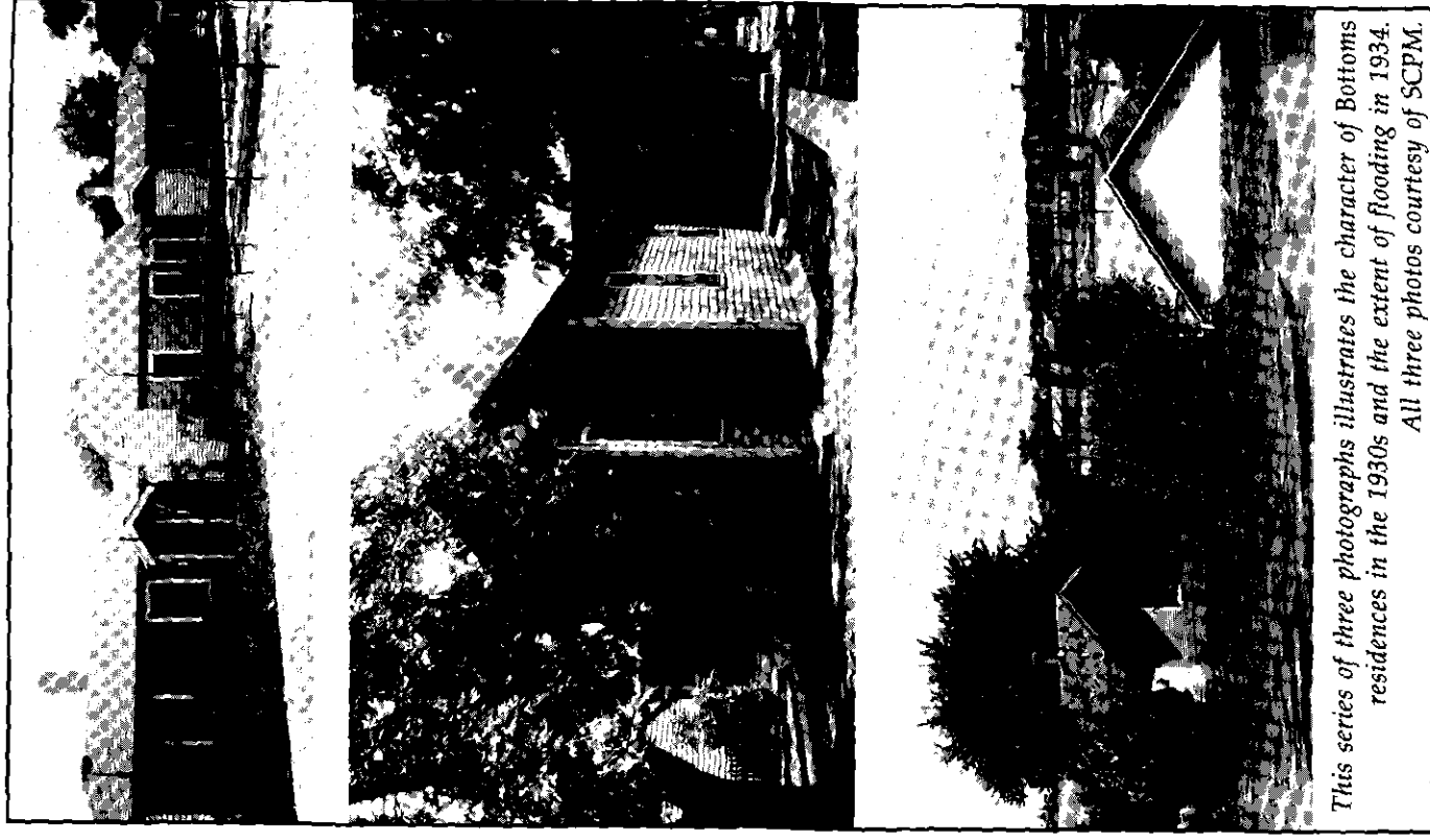
This series of three photographs illustrates the character of Bottoms residences in the 1930s and the extent of flooding in 1934.